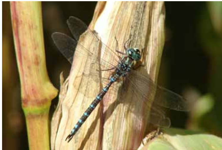
Canada Darner

We'll look for breeding birds in the Sandwich area. Bring binoculars and bug repellent. Waterproof shoes may be helpful. Meet at the parking area at the end of Diamond Ledge Road, about 2.5 miles from the blinker in Center Sandwich Contact: Tony Vazzano, tvazzano@ncia.net or 284-7718