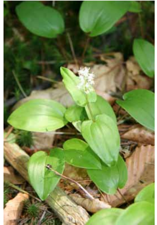
Canada Mayflower.