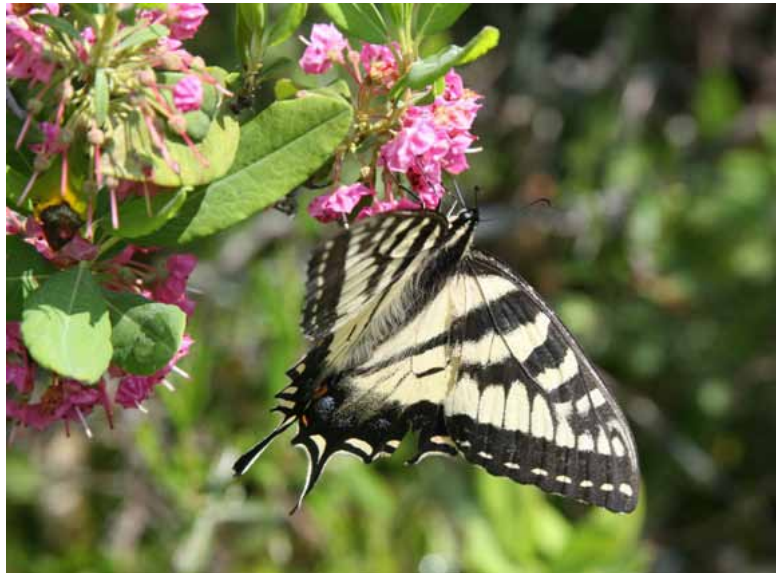
Eastern tiger swallowtail feeding on sheep laurel at Ponemah Bog.

Saturday, July 30, 10am Tom Young, Bird and Dragonfly Enthusiast