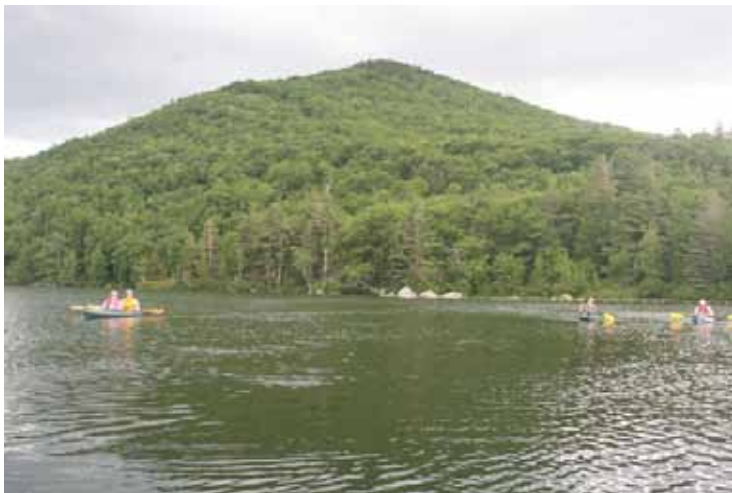
Bald Mountain from Willard Pond.

Join NH Audubon Biologist, Diane DeLuca, as we explore the spring happenings at the Deering Wildlife Sanctuary. Nearly 1,000 acres in size, the sanctuary is a rich mosaic of ponds, forests, vernal pools, open field, and interconnected wetlands. Combined with adjoining conservation lands there are approximately 3,000 acres of contiguous conservation land at this site. This field trip welcomes all ages as we observe and learn about spring events from vernal pools to bluebirds. We will create a plant and critter list, from bark beetles to beavers to black cherry. Walking will be easy to moderate. This program is presented in cooperation with the Deering Association. Preregistration is required by calling (603) 224-9909.