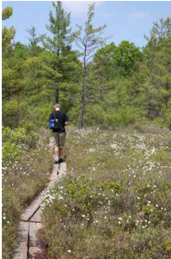
A walk at Ponemah Bog.