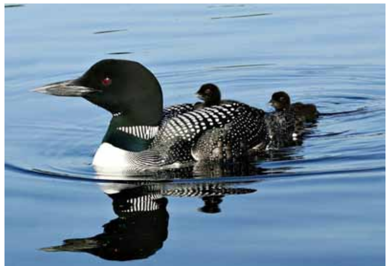
Loon Family

The Loon Center is a self-directed and self-funded constituent organization of NH Audubon located on the 200-acre Markus Wildlife Sanctuary. The Loon Preservation Committee exists to restore and maintain a healthy population of loons throughout New Hampshire; to monitor the health and productivity of loon populations as sentinels of environmental quality; and to promote a greater understanding of loons and the natural world. All gift shop proceeds benefit Common Loon research and preservation in New Hampshire.