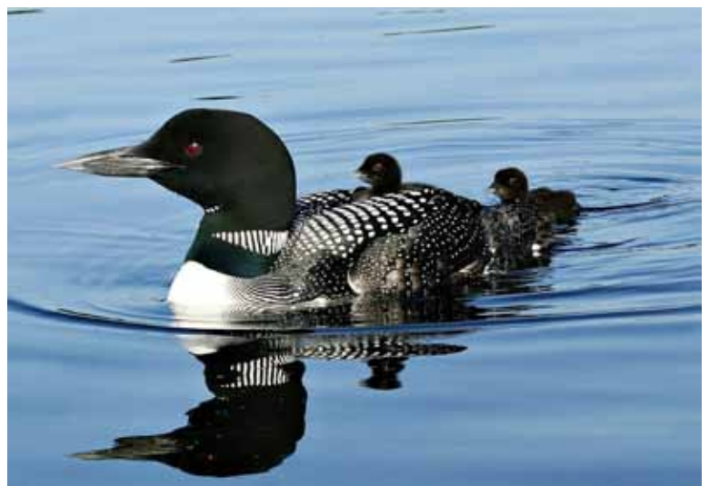
Massabesic Loon Family

Special savings in the Loon's Feather Gift Shop For more information call (603) 476-LOON.