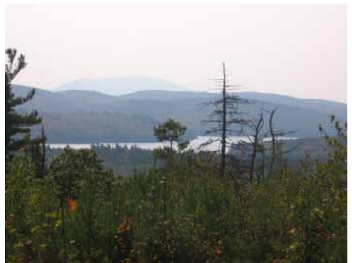
High-elevation hilltop scenery of the Willard Pond Wildlife Sanctuary Photo by Phil Brown.

Contact: RSVP with Phil Brown at pbrown@nhaudubon.org or at 224-9909x334.