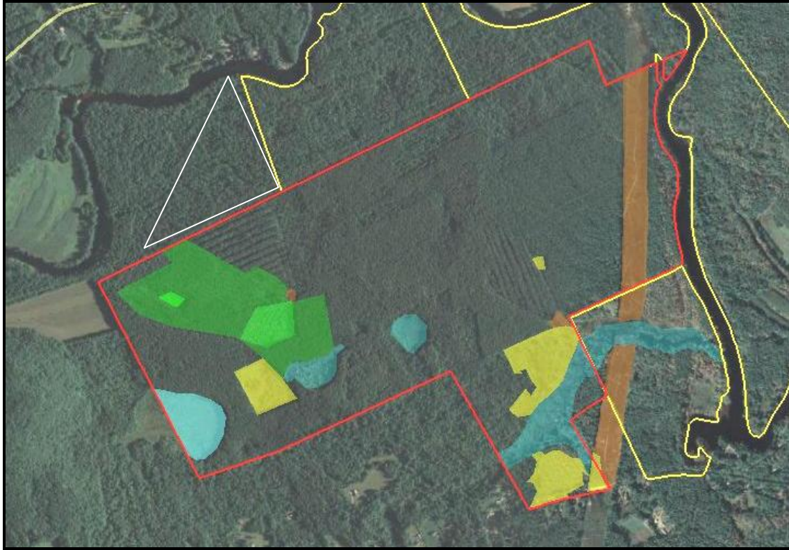
Figure 1. Aerial photograph of Mast Yard State Forest (red outline) and adjacent conservation lands (yellow outlines). The white triangle in the northwest indicates the approximate area that was selectively logged in the late summer of 2009 (see Fig. 2A for extent). Colored shading indicates the locations of habitats mentioned in the text, as follows: