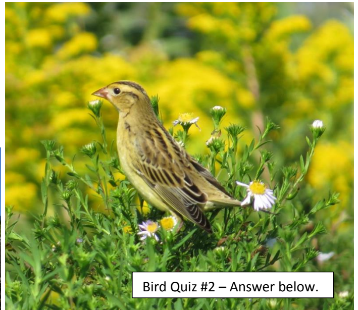
Bird Quiz #2 – Answer below.

Bird Quiz #1 – Cape May Warbler Bird Quiz #2 - Bobolink