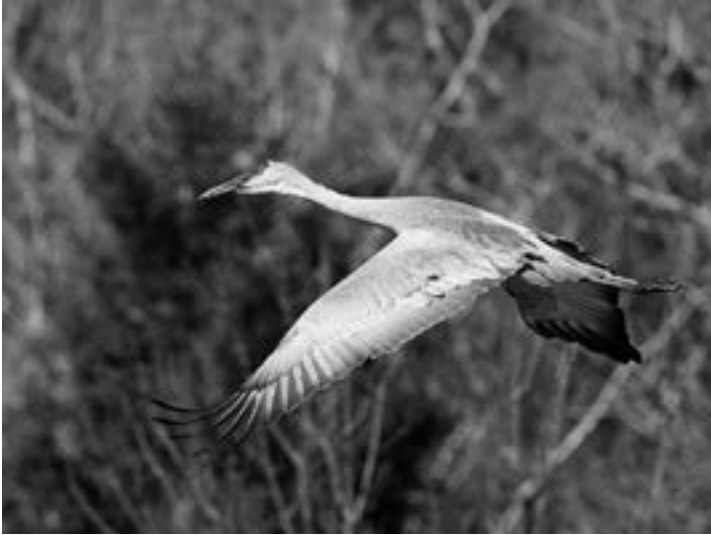
Sandhill Crane in Durham, NH.