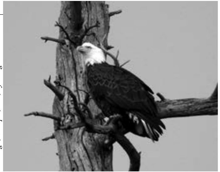
Bald Eagle, Sunapee, NH