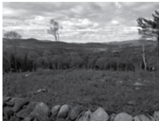
View from a wildlife cut atop Goodhue Hill on the Willard Pond Wildlife Sanctuary in Antrim.