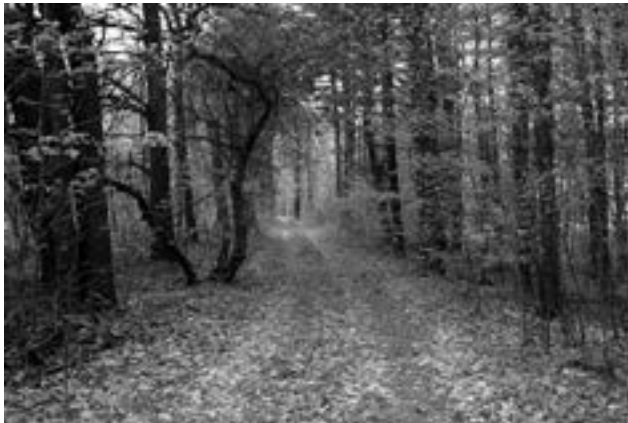
An old woods road on the Joseph Ford Wildlife Sanctuary.

Late last fall, NH Audubon helped play a key role in permanently protecting an ecological gem of the Oyster River watershed in Lee, NH. Come celebrate this ecologically-rich property on a special access field trip led by