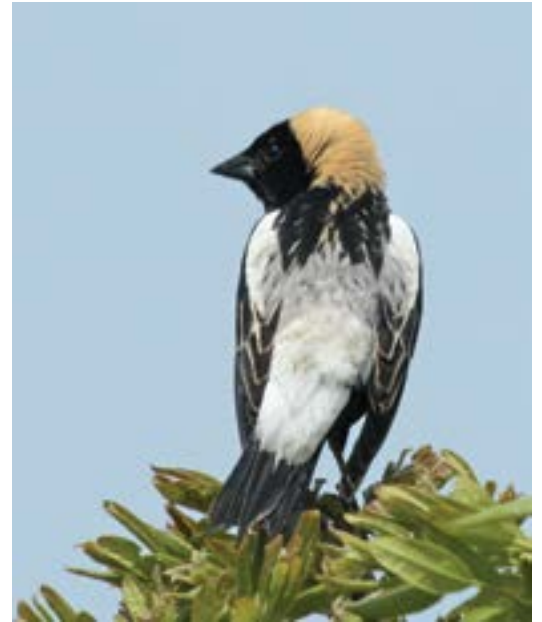
A male Bobolink, one of the declining grassland species of concern in New Hampshire (see article on page 1).

Our combination of professional biologists and citizen scientists is unique in New Hampshire's conservation community, and provides a sound scientific basis for land protection priorities and policy decisions. Our data helped to justify establishment of the Conte, Great Bay, and Umbagog National Wildlife Refuges, and protection of Wilcox Point, an important Bald Eagle roosting area on Great Bay.