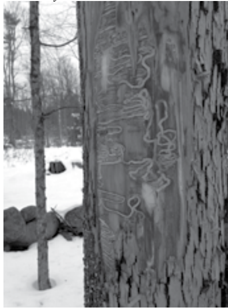
An Emerald Ash Borer infested ash tree in Canterbury, NH.