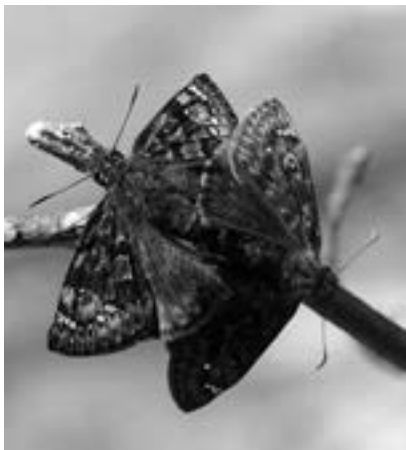
A pair of mating Horace's Duskywings