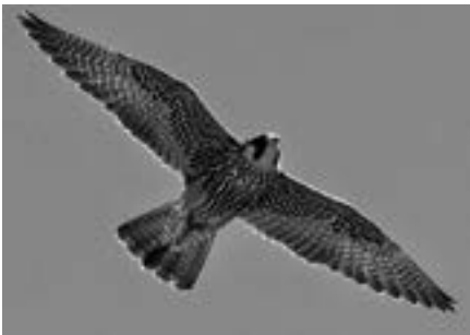
Immature Peregrine Falcon, Dover, NH