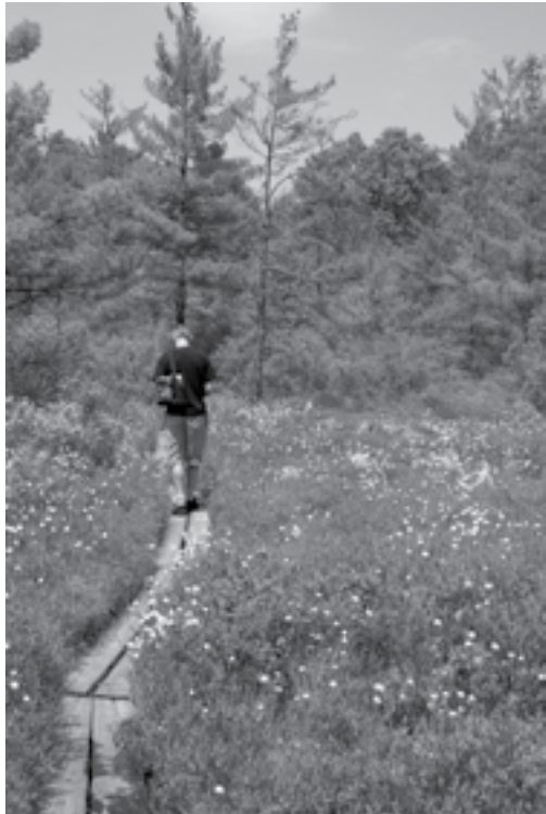
Ponemah Bog Wildlife Sanctuary

See listing under Sanctuary Happenings on page 11.