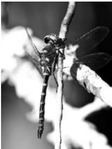
Ringed Boghaunter by Dennis Skillman.

Starting in 2012, NH Audubon and partners in New York and Maine embarked upon an ambitious project to determine the conservation status of all 228 species of dragonflies and damselflies that occur from Virginia to Maine. Using data from all 14 states in the region (including the recently-completed NH Dragonfly Survey), the team assessed factors such as range size, changes in range, and habitat specificity to place each species in categories representing both vulnerability and "responsibility" (the importance of the Northeast in overall conservation). An example of a high concern species is the Ringed Boghaunter (listed as endangered in