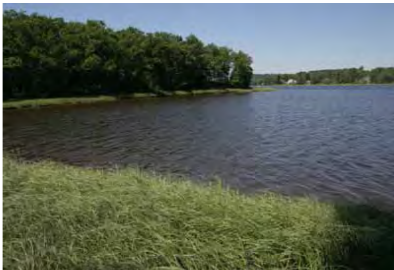
Bellamy River Sanctuary, photo by Phil Brown.

Contact: Dan Hubbard, 332-4093, danielhubbard@peoplepc.com or see our web site at www.seacoastchapter.org/programs