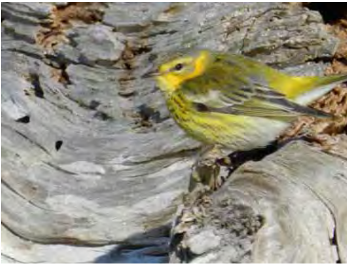
The Odiorne Cape May Warbler, photo by Pam Hunt.

One of the remarkable stories of the past winter was that of a Cape May Warbler which survived the entire season at Odiorne Point State Park in Rye, where it fed on brine flies and was enjoyed and photographed by hundreds of people. At that time of year, a Cape May Warbler should have been a couple of thousand miles south in the Caribbean, not within a couple of hundred miles of its breeding grounds in the boreal conifer forests of northern New England and eastern Canada. It's in this breeding habitat that our story is set, with Cape May Warbler as one of the key players.