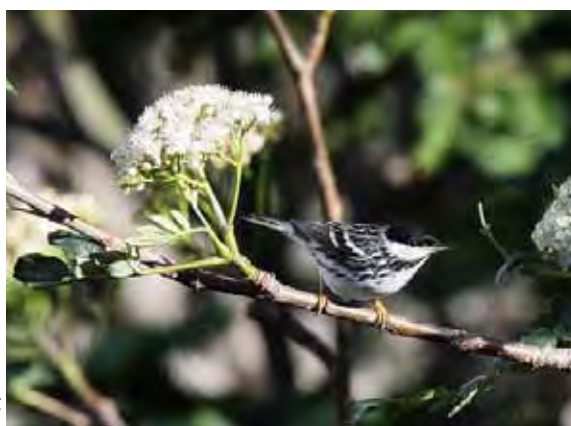
Blackpoll Warbler, photo by Len Medlock.

Visit www.mascomabirds.org for listings.