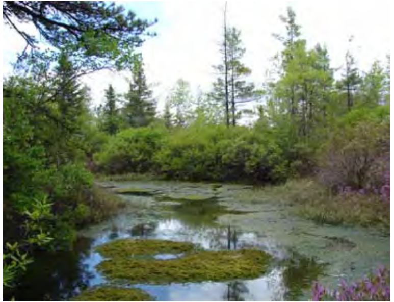
Ponemah Bog in Amherst