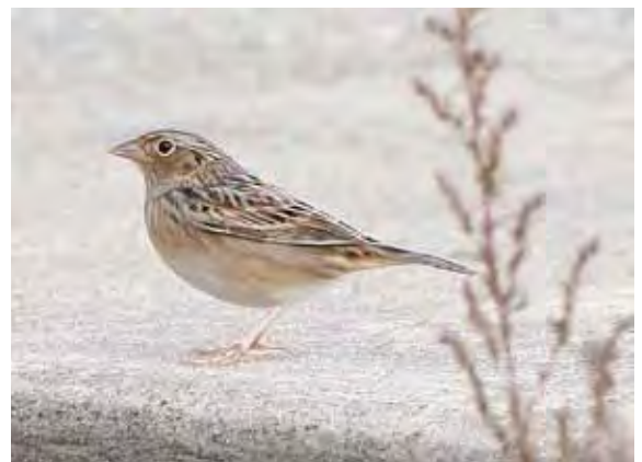
Grasshopper Sparrow