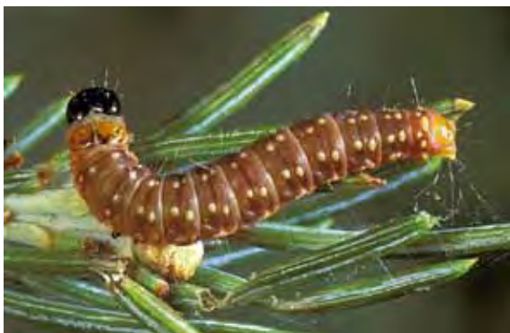
Spruce budworm caterpillar on fir.

But while budworm caterpillars are a boon to birds, they are the opposite to foresters, since a large infestation can kill millions of acres of trees and reduce timber values. As a result, significant effort has gone into budworm control in recent decades, and the last major outbreak in the Northeast was in the early 1980s (although a small one is slowly growing in Quebec). It stands to reason that if an outbreak is prevented from getting too large (usually through pesticide spraying or pre-emptive harvest), it is less likely to attract and support large numbers of budworm specialist birds. This is certainly one of the major hypotheses put forward to explain consistent declines in populations of Cape May, Bay-