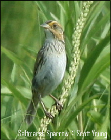
Saltmarsh Sparrow

An estimated 800 Saltmarsh Sparrows use the Hampton-Seabrook Estuary, making it by far the largest concentration in New Hampshire. These sparrows nest in the "high marsh," an area slightly higher than the rest of the estuary and closest to adjacent uplands. Even here they are at great risk from the daily tidal cycle, and during