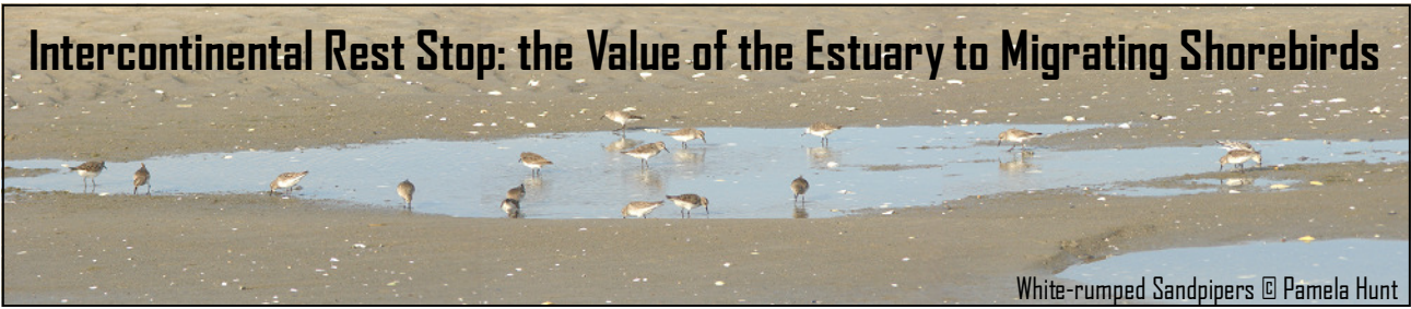
White-rumped Sandpipers

Depending on when you visit, the core of the Hampton-Seabrook Estuary is either a large bay or an extensive mudflat. It is the mudflats that provide a critical resource to migratory shorebirds such as sandpipers and plovers. Each fall, thousands of these birds stop at coastal locations in the Northeast to refuel on their southbound journeys from breeding grounds in the Canadian arctic. Here in the estuary they feed for two to four weeks and nearly double their weight in preparation for a non-stop flight over the western Atlantic Ocean to their wintering grounds in the Caribbean or South America.