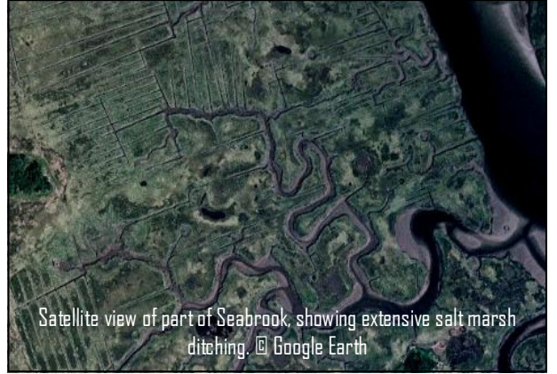
Satellite view of part of Seabrook, showing extensive salt marsh ditching.

cally created in attempts to drain the marsh, reduce mosquito populations, or improve hay production, and these ditches remain as scars on the landscape for years to come. At the same time, poorly-designed bridges and culverts restrict tidal flows and allow invasion by freshwater and invasive plants.