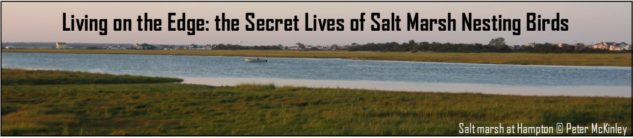
Salt marsh at Hampton

Salt marshes are not just an important breeding area for fish. Several species of birds nest here, including four that are restricted to these habitats along the Atlantic coast. Foremost among these in New Hampshire is the aptly-named Saltmarsh Sparrow, a bird whose entire range is restricted to a narrow strip of coastline from Maine to North Carolina. Other breeding species include a small population of Willets, and the occasional Seaside Sparrow or Nelson's Sparrow. A small colony of Common Terns also nests here, and many more terns from the Isles of Shoals commute to the estuary to feed.