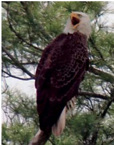
Bald Eagle.

Together we will explore what goes on above and below its surface and learn all about the animals and plants that make up our rich Merrimack River community.