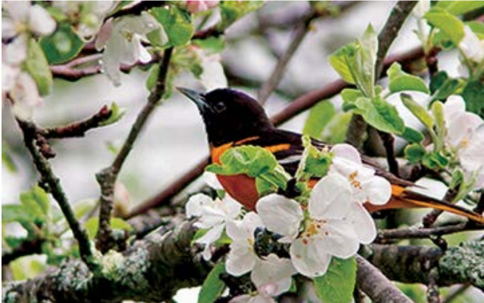
Baltimore Oriole in an apple tree.

With the coming of spring New Hampshire's landscape will once again be graced by lovely wildflowers and colorful singing birds. It is a wonderful time to get out and enjoy these natural wonders, and at the same time do something to help protect them.