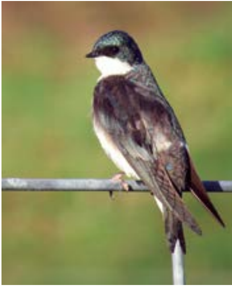
Tree Swallow.

and climate change, suggesting certain models that people can take with them into their municipal systems, businesses, and every day life, that will help mitigate the destructive forces we have unleashed.