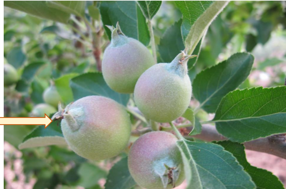
Pollinated Apples Growing