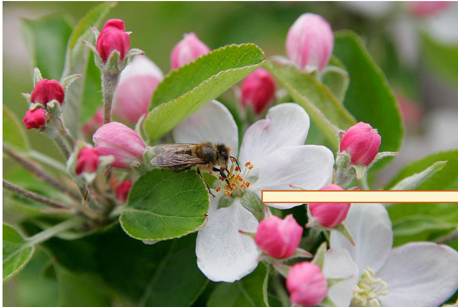
Apple Blossom with Pollinator

When pollen is moved from one flower to another, the fruit of the plant begins to grow! What do you think grows inside the apple?