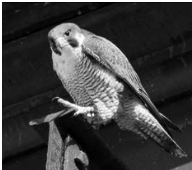
This 13-yr old male peregrine is nesting in Lawrence MA. He is "black/green *6/*4," an offspring of the Manchester NH pair in 2001.

At Holts Ledge in Lyme, one of NH's most productive sites over the long-run, a remarkable five young fledged in 2014.