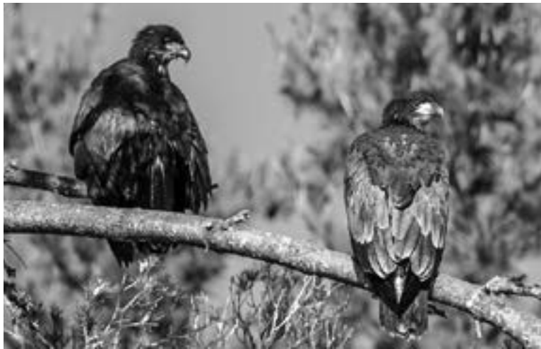
Two juvenile eagles fledged in 2014 from a nest on Moore Reservoir in Littleton, NH.