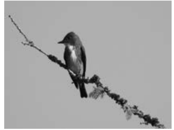
Olive-sided Flycatcher by David Forsyth

Volunteers were recruited to survey priority areas in June and July, with surveys involving repeated visits to locations with suitable habitat. A total of 13 observers adopted one or more areas to survey, and additional supplemental data were obtained from eBird and other observers. In the end, we obtained data